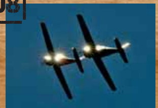
LSZL