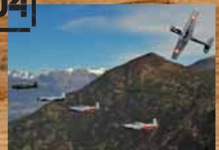
LAGO MAGGIORE