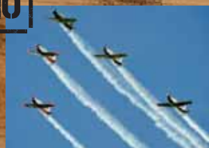
LSZB © WERNER EBEDI WWW.AVIAPIC.CH