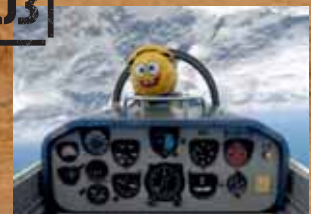
SWISS ALPS