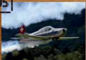
LSMF