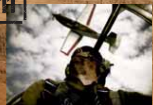
LSMIL © TOM PORTA WWW.TOMPORTAPAININGS.COM