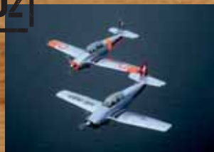
LAGO MAGGIORE